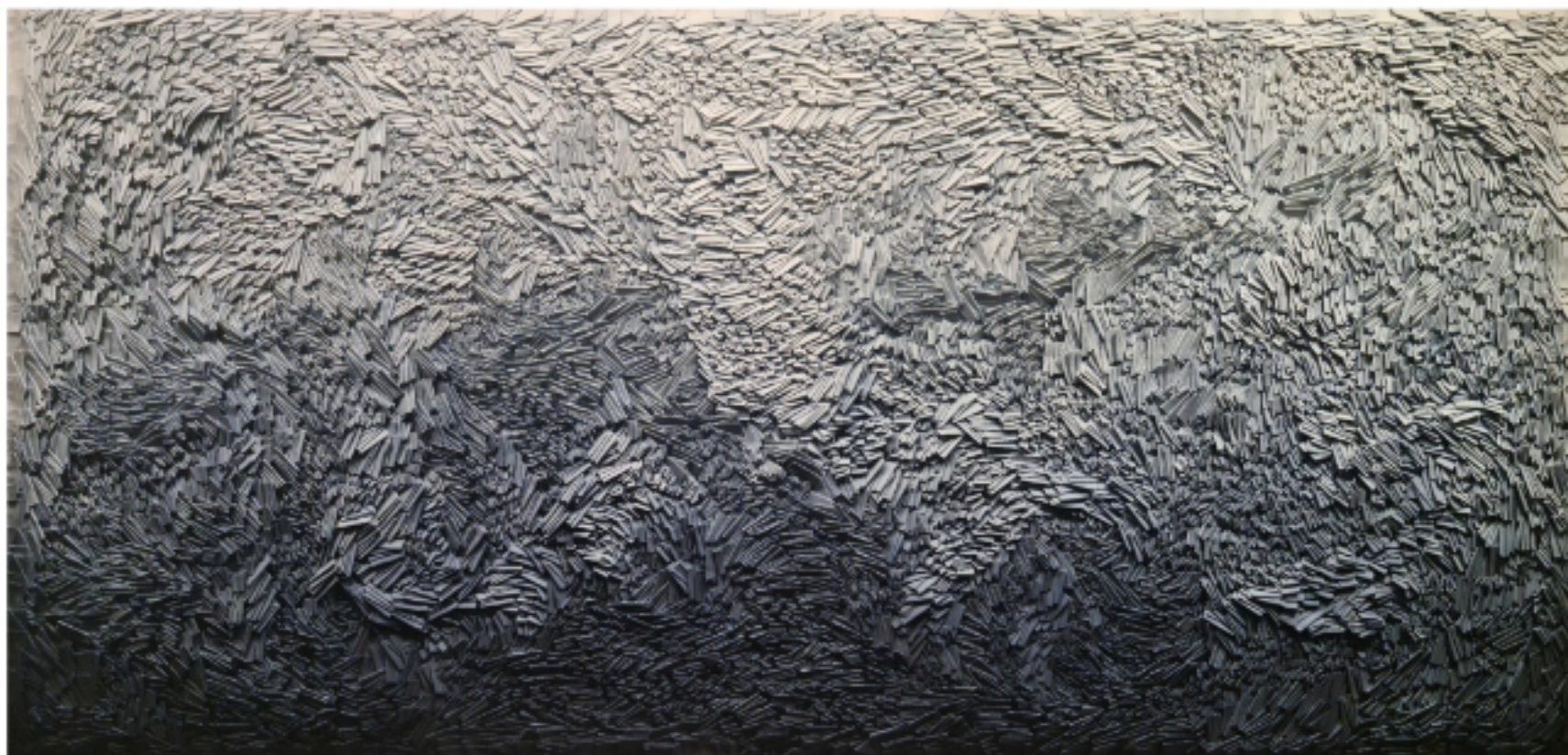
The Great Encounter

The artwork "The Great Encounter," meticulously crafted on FSC-certified ecological paper with water-based paints, serves as a poignant reminder of humanity's responsibility towards the planet. In this piece, the title refers to the need to preserve and respect the oceans. Through a seamless fusion of two-dimensional and three-dimensional effects, this work creates a mesmerizing symbiosis of form and color, light and shadow, movement and stillness. The motion invites viewers on a contemplative journey, transcending borders and prompting reflections on the interconnectedness of life, society, and nature. "The Great Encounter" weaves a compelling narrative, urging us to reconsider our relationship with the environment and the urgent need for collective action.